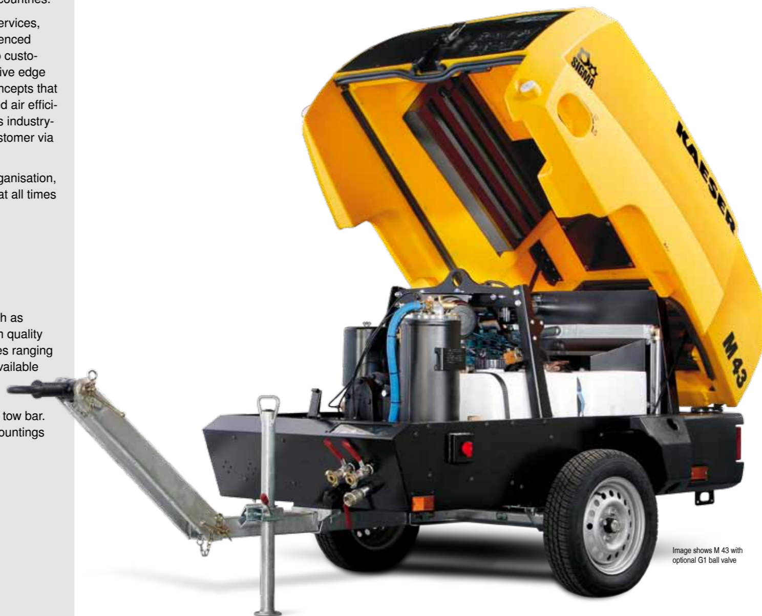
Image shows M 43 with optional G1 ball valve